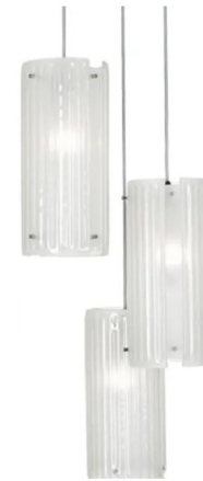
Shown in beige silver / frosted strata

PRODUCT DIMENSIONS . . . . . Min/Max Adjustable Length: 15.5" - 133.5"