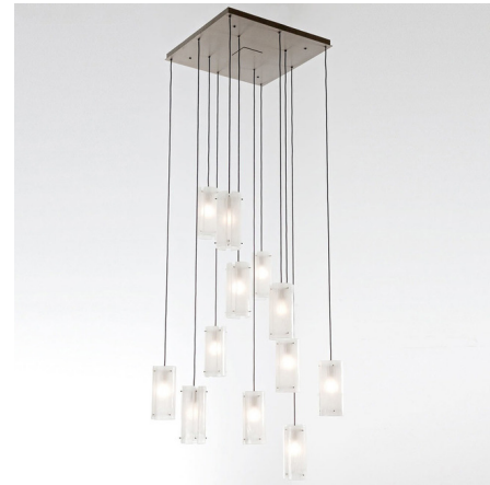
Shown in beige silver / frosted granite

The Textured Glass Square Multi Light Pendant brings a visual masterpiece to your interior space. The glass requires skilled artisan precision and two kiln passes to achieve this stunning look. Each piece is a unique work of art. Available in 9 and 12 light options. Canopy: sizes on spec sheet.