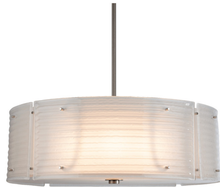
Shown in beige silver / frosted strata

The Textured Glass Drum Pendant brings a visual masterpiece to your interior space. The glass requires skilled artisan precision and two kiln passes to achieve this stunning look. Each piece is a unique work of art. Sloped ceiling compatible up to 45 degrees. Canopy: 6 inch diameter.