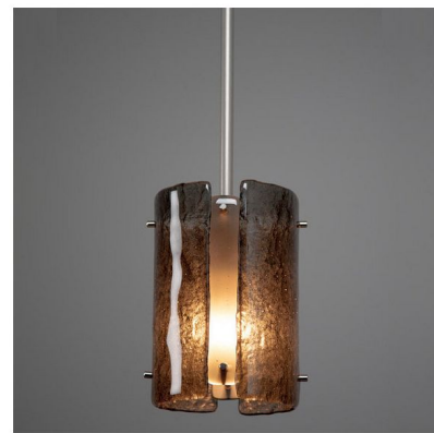
Shown in beige silver / smoke granite

The Textured Glass Pendant brings a visual masterpiece to your interior space. The glass requires skilled artisan precision and two kiln passes to achieve this stunning look. Each piece is a unique work of art. Available in two sizes with a cord or downrod. Cord and Downrod lengths are listed on the line drawing. Canopy: 6 inch diameter.