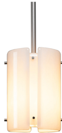
Shown in beige silver / ivory wisp

The Textured Glass Pendant brings a visual masterpiece to your interior space. The glass requires skilled artisan precision and two kiln passes to achieve this stunning look. Each piece is a unique work of art. Available in two sizes with a cord or downrod. Cord and Downrod lengths are listed on the line drawing. Canopy: 6 inch diameter.