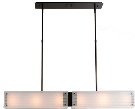
Shown in flat bronze / frosted strata

The Textured Glass Linear Pendant brings a visual masterpiece to your interior space. Each of the panels of glass requires skilled artisan precision and two kiln passes to achieve this stunning look. Each piece is a unique work of art. Sloped ceiling adaptable to a max of 45 degrees. Adjustable in 3 inch increments.