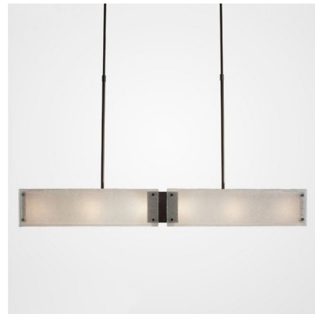
Shown in flat bronze / frosted granite

The Textured Glass Linear Pendant brings a visual masterpiece to your interior space. Each of the panels of glass requires skilled artisan precision and two kiln passes to achieve this stunning look. Each piece is a unique work of art. Sloped ceiling adaptable to a max of 45 degrees. Adjustable in 3 inch increments.