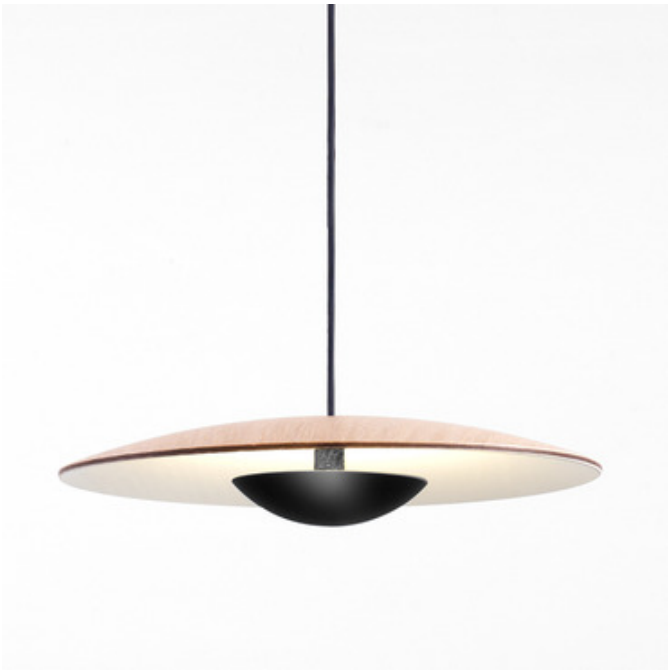
Shown in: Matte Black / Oak / White Interior

Wood is a great ally of cozy lighting. It is a material that is hard to mold, a challenge that the Ginger Pendant neatly resolves. The combination of sheets of wood, paper, and resins pressed together under high pressure achieves a laminate that appears almost entirely flat, which discreetly lights up spaces with indirect light. The resulting Ginger Pendant is an extraordinarily lightweight disk that pays tribute to 1960's rock star, Ginger Baker of Cream.