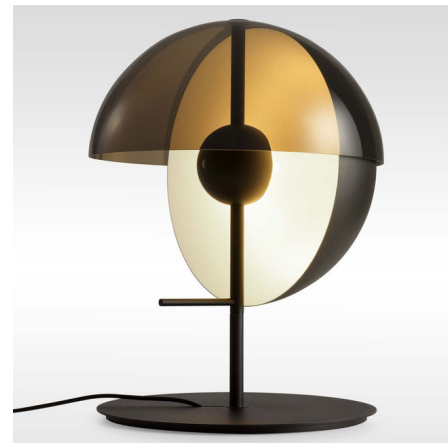
Shown in black / smoke

COLOR RENDERING 90 CRI LAMP COLOR 2700K LUMENS/WATT 111.34 LUMINOUS FLUX 913 lumens