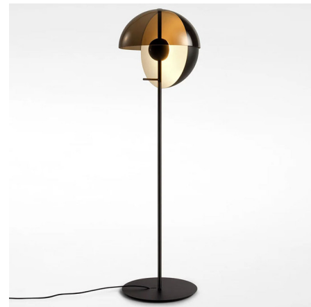
Shown in black / smoke

LAMP COLOR . . . . . 2700K LUMENS/WATT . . . . . 76.14 LUMINOUS FLUX . . . . . 1066 lumens