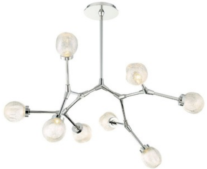
Shown in: Polished Nickel / Clear

The bold Catalyst Chandelier is crafted from aluminum with artisan-blown free form art glass. Adjust at joints to customize look. Includes three 12 inch and one 6 inch downrod. Universal voltage driver within 4 inch junction box. Can be mounted on sloped ceilings, hang straight swivels up to 90 degrees. Dimmable with a low voltage electronic dimmer, sold separately.