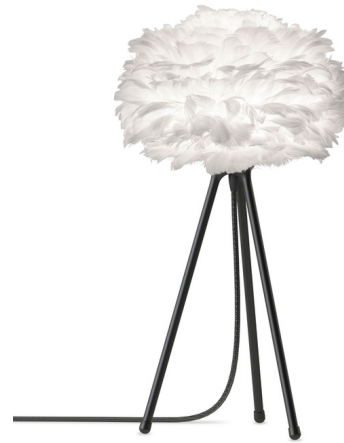
Shown in black / white

The Eos Table Lamp will add a warm and playful accent to your space with its genuine goose down feather shade. Each feather is carefully positioned around a paper core by hand, making each piece unique. The shade sits atop a tripod base with slender legs for a contemporary expression. On/off switch located on cord.