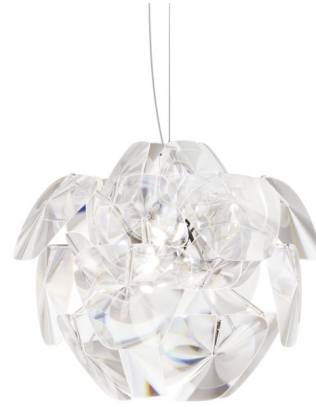
Shown in polished stainless steel / transparent

The Hope Pendant features a series of thin polycarbonate fresnel lenses, created using imprinted micropisms on polycarbonate film to achieve a dioptic effect similar to glass without the weight, space and thickness. Features a pressed and bent mirror polished stainless steel frame, injection molded polycarbonate arms and transparent polycarbonate prismatic lenses.