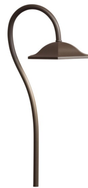
Shown in textured architectural bronze