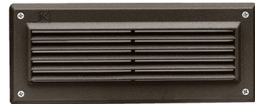
Shown in textured architectural bronze

12 Volt Louvered Brick Light designed to be integrated into brick wall during construction. Finish in Textured Architectural Bronze. One 12 volt integrated LED module in 2700K or 3000K color temperature. ETL listed. Suitable for wet locations. 9-15V AC/DC operating range. Required transformer sold separately.