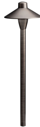
Shown in centennial brass

The 12 Volt Path Light is ideal for all drop in LED path and spread needs. This fixture features thick cast construction, a glass lensed dome, and an easy one point shade connection. Includes 48 inch usable #18-2, SPT-1W leads, 8 inch in ground slotted stake, and 2 gel-filled wire nuts. Note: Required low voltage transformer and optional accessories sold separately.