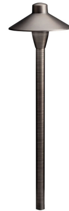
Shown in centennial brass

The 12 Volt Path Light is ideal for all drop in LED path and spread needs. This fixture features thick cast construction, a glass lensed dome, and an easy one point shade connection. Includes 48 inch usable #18-2, SPT-1W leads, 8 inch in ground slotted stake, and 2 gel-filled wire nuts. Note: Required low voltage transformer and optional accessories sold separately.