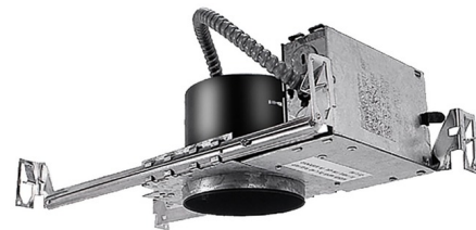
Shown in steel