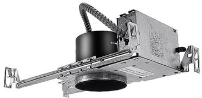
Shown in: Steel

Low Voltage 4 Inch New Construction Non-IC Housing is 20 gauge galvanized steel and includes an electronic transformer. Non-IC designation requires a minimum 3 inch clearance on all sides of housing when insulation is present. Suitable for shallow joist installation. Ceiling cutout: 4 9/16 inch. Requires one 12 volt GU5.3 MR16 halogen or LED HR and 84 series 4 inch trim. A complete fixture includes a housing and trim, sold separately.