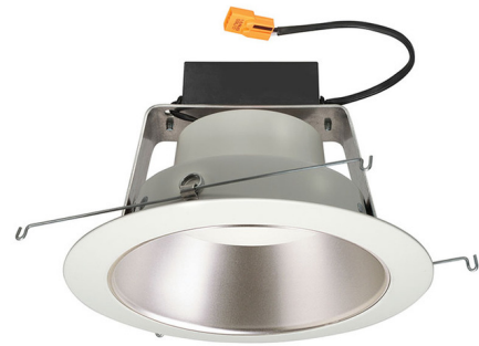
Shown in white / haze