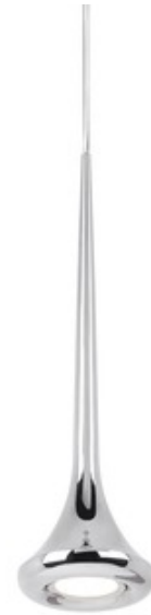
Shown in: Chrome / Frosted

The Bach Mini Pendant features a slender trumpet shaped body with bottom frosted diffuser.