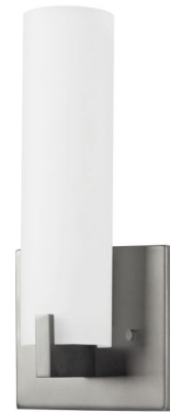
Shown in brushed nickel / white opal

LAMP LIFE . . . . . 50000 hours COLOR RENDERING . . . . . 90 CRI LAMP COLOR . . . . . 3000K LUMENS/WATT . . . . . 56.00 LUMINOUS FLUX . . . . . 616 lumens