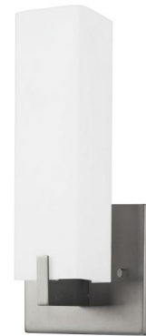
Shown in brushed nickel / white opal

LAMP LIFE . . . . . 50000 hours COLOR RENDERING . . . . . 90 CRI LAMP COLOR . . . . . 3000K LUMENS/WATT . . . . . 59.70 LUMINOUS FLUX . . . . . 597 lumens