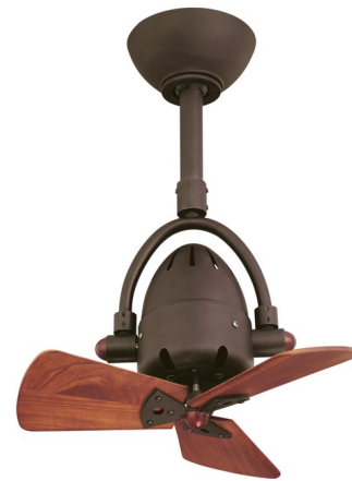
Shown in textured bronze / mahogany wood

BLADE COLOR Mahogany Wood BODY FINISH Textured Bronze WATTAGE N/A DIMMER N/A DIMENSIONS 16"W x 24"H BULB N/A COUNTRY OF ORIGIN China