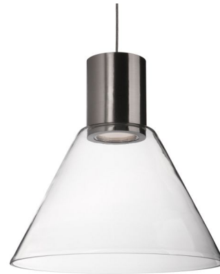
Shown in brushed nickel / clear

LAMP LIFE . . . . . 50000 hours COLOR RENDERING . . . . . 90 CRI LAMP COLOR . . . . . 3000K LUMENS/WATT . . . . . 55.00 LUMINOUS FLUX . . . . . 440 lumens