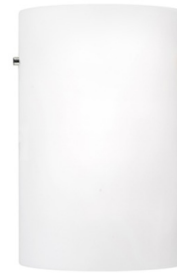
Shown in brushed nickel / white opal

LAMP LIFE . . . . . 50000 hours COLOR RENDERING . . . . . 90 CRI LAMP COLOR . . . . . 3000K LUMENS/WATT . . . . . 63.89 LUMINOUS FLUX . . . . . 575 lumens