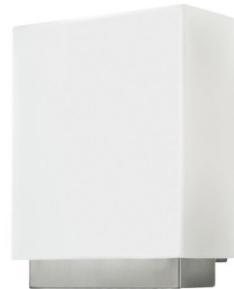
Shown in brushed nickel / white opal

Hounslow Wall Light features rectangular shaped white opal glass with metal details in brushed nickel or chrome. Built in LED module totaling 11 watts is included. ETL listed. 7 inch width x 9.25 inch height x 4.5 inch depth.