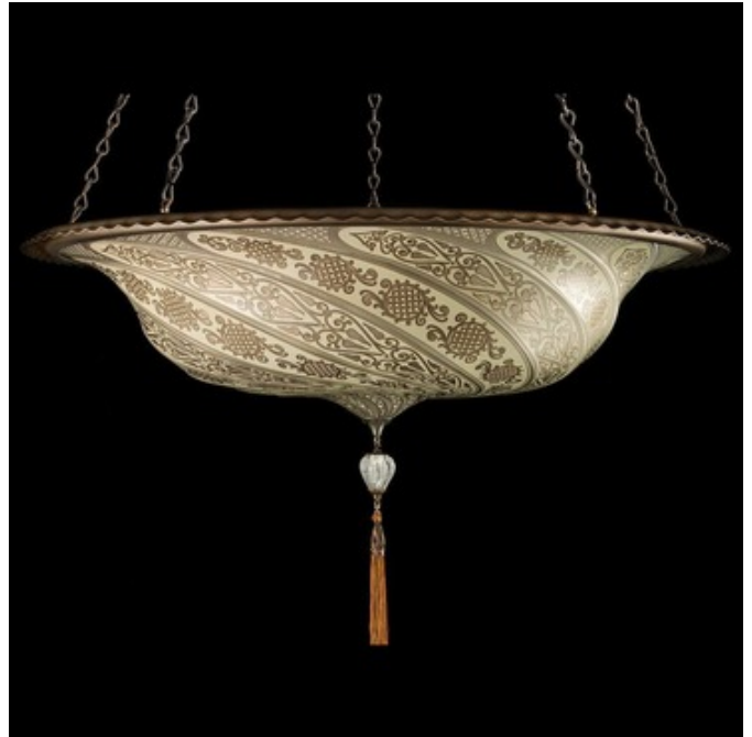
Shown in: Brass / Gold Classic

The Scudo Saraceno Glass Pendant is inspired by the Saraceno Shield from Medieval times. The delicate silk is complemented by striking details with a brass structure finish and a dark brown canopy in a stylistic Turkish -Venetian motif. Available in White Classic, Silver Classic, Gold Classic, Red Mosaic, or Gold Mosaic in three sizes. Made in Italy. NOTE: No Gold Mosaic in smallest size and No White Classic in largest size.