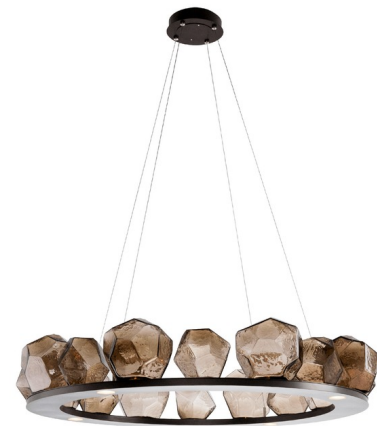
Shown in flat bronze / bronze

PRODUCT DIMENSIONS . . . . . Max Overall Length: 145" COLOR RENDERING . . . . . 93 CRI LAMP COLOR . . . . . 2700K LUMENS/WATT . . . . . 1,578.57 LUMINOUS FLUX . . . . . 3315 lumens