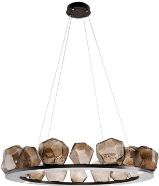
Shown in: Flat Bronze / Bronze

The Gem Ring Single Tier Chandelier is jewelry for your home. Features gems of LED lit hand blown glass that are meticulously crafted by Hammerton artisans. The fixture gives a nod to an organic aesthetic that exudes casual sophistication. Each shade takes the place of a traditional bulb and unfolds with striking illumination. The finished look is relaxed, soft and unique. Each glass shade is a one of a kind artisan creation. Available in three sizes. Canopy: 8 inch diameter.