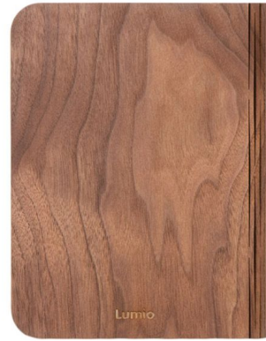
Shown in dark walnut

Lumio is a dynamic, multi-functional portable lamp that conceals itself in the form of a hard-cover book. Opens 360 degrees and comes with a custom orange micro-USB charger, magnetic wooden pegs for mounting, and a beautiful leather strap for hanging. Features industrial grade neodymium magnets built into the wood cover to maintain portability and flexibility. A rechargeable lithium ion battery provides up to 8 hours of full charge with continual use, the light may be turned on while charging. Available in Dark Walnut or Blonde Maple wood covers.