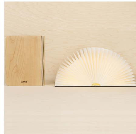
Shown in blonde maple

Lumio is a dynamic, multi-functional portable lamp that conceals itself in the form of a hard-cover book. Opens 360 degrees and comes with a custom orange micro-USB charger, magnetic wooden pegs for mounting, and a beautiful leather strap for hanging. Features industrial grade neodymium magnets built into the wood cover to maintain portability and flexibility. A rechargeable lithium ion battery provides up to 8 hours of full charge with continual use, the light may be turned on while charging. Available in Dark Walnut or Blonde Maple wood covers.