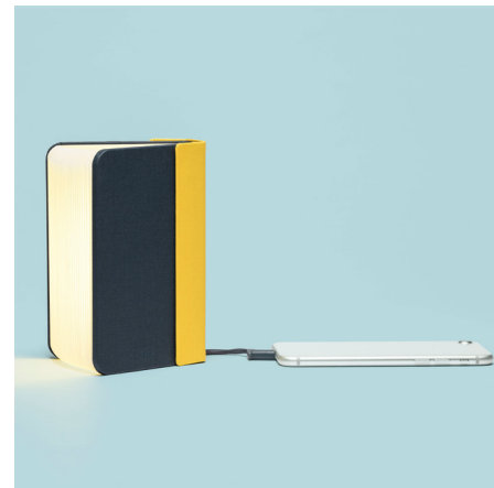
Shown in navy / yellow spine

LAMP COLOR 2700K LUMENS/WATT 56.82 LUMINOUS FLUX 250 lumens