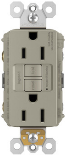
Shown in: Nickel

DESCRIPTION Radiant Spec Grade 15 or 20 Amp Tamper Resistant Self Test GFCI conducts an automatic test every three seconds, ensuring it's always ready to protect. If the device fails the test, the indicator light flashes to signal that the GFCI should be replaced. It also has our proven SafeLock Protection feature: if critical components are damaged and protection is lost, power to the receptacle is disconnected. Feed-thru wiring configuration allows GFCI to protect downstream receptacles. Prevents line-load reversal miswire: no power to the face or downstream receptacles if wired incorrectly. Feed-thru wiring configuration allows GFCI to protect downstream receptacles. High-impact-resistant thermoplastic construction. Class A rated GFCI. UL Standard. UL listed.Note: >/ B> Radiant Screwless Wall Plate sold separately.