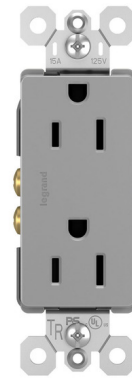
Shown in grey

Radiant 15 Amp or 20 Amp Tamper Resistant Receptacle is a step up from the standard with simple, classic options in wiring devices, home automation controls and screwless wall plates that complement today's homes. Meets National Electrical Code Tamper-Resistant requirements. Protects children: patented shutter system helps prevent improper insertion of foreign objects now with black invis-shutters for an invisible effect preferred by end users. High-impact resistant thermoplastic construction. Low profile face. Note: Radiant Screwless wall plates are sold separately.