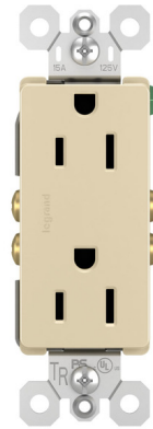
Shown in ivory

Radiant 15 Amp or 20 Amp Tamper Resistant Receptacle is a step up from the standard with simple, classic options in wiring devices, home automation controls and screwless wall plates that complement today's homes. Meets National Electrical Code Tamper-Resistant requirements. Protects children: patented shutter system helps prevent improper insertion of foreign objects now with black invis-shutters for an invisible effect preferred by end users. High-impact resistant thermoplastic construction. Low profile face. Note: Radiant Screwless wall plates are sold separately.