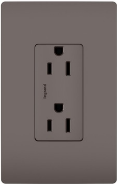
Shown in: Dark Bronze

Radiant 15 Amp or 20 Amp Tamper Resistant Receptacle is a step up from the standard with simple, classic options in wiring devices, home automation controls and screwless wall plates that complement today's homes. Meets National Electrical Code Tamper-Resistant requirements. Protects children: patented shutter system helps prevent improper insertion of foreign objects now with black invis-shutters for an invisible effect preferred by end users. High-impact resistant thermoplastic construction. Low profile face. Available in White, Light Almond, Grey, Brown, Black, Ivory, Nickel, Graphite and Dark Bronze. UL listed NOTE; RADIANT SCREWLESS WALL PLATE SOLD SEPARATELY.