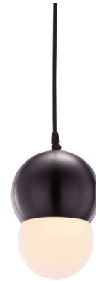
Shown in statuary bronze / white opal

LAMP COLOR . . . . . 3000K LUMENS/WATT . . . . . 97.14 LUMINOUS FLUX . . . . . 680 lumens