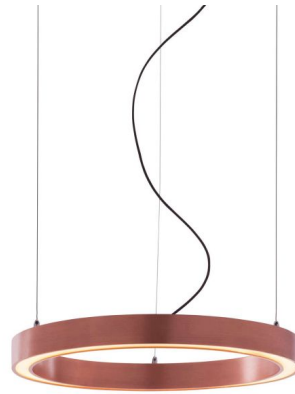
Shown in brushed copper

Ring Pendant, designed by Filipie Lisboa, is a circular band made of steel and finished in Brushed Copper, Hairline Bronze, Statuary Bronze, or White. Its diffuser feature ensures even light output around the whole ring. Available in small, medium, and large sizes. 30/36/48 watt LED module is included. Dimmable with a low voltage electronic dimmer. CE listed. ETL listed. Small: 24 inch width x 2.4 inch height x 108 inch maximum length. Medium: 36 inch width x 2.4 inch height x 108 inch maximum length. Large: 48 inch width x 2.4 inch height x 108 inch maximum length.