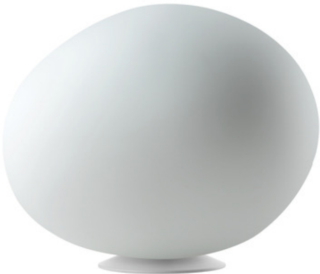
Shown in: White / White

The Gregg Glass Table Lamp brings a decorative, organic look to your interior space. Reminiscent of pebbles smoothed by water which light up with sunlight. White blown acid etched glass is complemented by a White finish. Available with an on/off switch, or a dimming switch, both located on the cord.