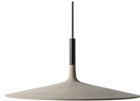
Shown in concrete grey