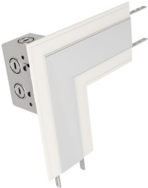
Shown in: White

TruLine 1.6A L-Shape Dual Power Channel Connector allows 24VDC power to be fed from corners for 90 degree turns (with power) in picture frame installations. Two (2) LED Soft Strips (not included) bend on the side within power connector to create continuous illumination on a wall or ceiling. LP2 Dual Feed version powers two separate LED Soft Strip sections. LED Soft Strip is installed on the side of the channel lens. Includes Lens, Channel Joiners, TL1.6A Junction Box, Adjustable Mounting Bars, and Channel Solderless Snap & Light Power Connectors. Designed for use with Pure Lighting TruLine 1.6A plaster-in LED system.