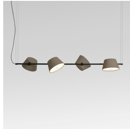
Shown in black / brown grey

The Tam Tam Linear Pendant is a new perception in the world of lamps. It features a number of Semi Matte shades pointed in different directions, geometrically arranged to invoke a feeling of organized chaos. Available with 4 or 6 shades which can be rotated 360 degrees by means of a swivel mechanism. Opalescent, methacrylate bottom diffusers soften the light.