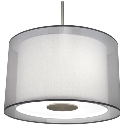
Shown in stainless steel

The Saturnia Pendant features a dual-layered shade with a transparent outer layer and white interior for a unique, ethereal look. Saturnia's understated elegance is perfectly suited to living rooms, dining rooms, or any space in need of decorative but functional lighting. Compatible with sloped ceilings.