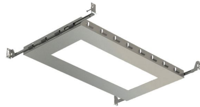
Shown in steel

The Multiples 4 Inch Trimless New Construction Mounting Plate is designed for use with integrated LED or 120 volt GU10 MR16 lamp option remodel housings with trimless flange, sold separately.