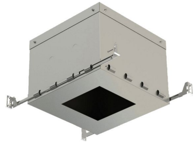
Shown in steel