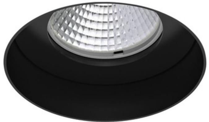
Shown in: Black

The 28715 3 Inch Round Aperture Non-IC Remodel Housing with Downlight Trimless is constructed of 18 gauge powder coated steel. Non-IC designation requires that insulation be kept a minimum of 3 inches away from housing. Includes steel mesh plate with perforated perimeter to allow mud to bond to mounting surface leaving a seamless finish in the ceiling. Includes 15 watt, 120 volt LED module with 40 degree beam angle in 3000K or 3500K color temperature, 80+CRI, 1290 lumens. Class 2 dimmable constant current driver included. Driver box mates to fixture by 12 inch flexible BX cable. Thermally protected. Input voltage: 120 volt. Dimmable with a TRIAC dimmer, sold separately. Cutout: 3 inch round. Can be converted to a Non-IC new construction housing using the 30537-019 mounting plate.