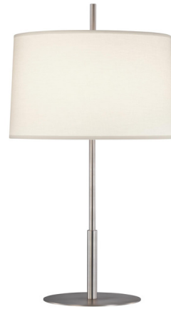
Shown in stainless steel / fondine

The Echo Table Lamp offers an elegant expression with its slim candlestick base and fondine fabric drum shade. Its sleek, refined silhouette brings a touch of sophistication to any interior. 3-way switch located on socket.