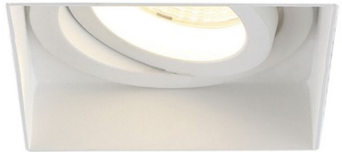
Shown in: White

The Amigo 28718 3 Inch Square Aperture Non-IC Remodel Housing with Gimbal Trimless is constructed of 18 gauge powder coated steel. Non-IC designation requires that insulation be kept a minimum of 3 inches away from housing. Includes steel mesh plate with perforated perimeter to allow mud to bond to mounting surface leaving a seamless finish in the ceiling. Includes 15 watt, 120 volt LED module with 40 degree beam angle in 3000K or 3500K color temperature, 80+CRI, 1290 lumens. 30 degree tilt. Class 2 dimmable constant current driver included. Driver box mates to fixture by 12 inch flexible BX cable. Thermally protected. Input voltage: 120 volt. Dimmable with a TRIAC dimmer, sold separately. Cutout: 3 inch square. Can be converted to a Non-IC new construction housing using the 30536-012 mounting plate.