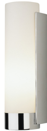
Shown in polished chrome / frost white

The Tyrone Wall Sconce will add a sophisticated modern accent to any interior with its sleek silhouette. The frosted glass cylinder provides gently diffused lighting perfect for entryways, bathrooms, and more. Includes metal junction box cover plate in matching finish, not pictured. ADA compliant. UL listed for indoor damp locations.