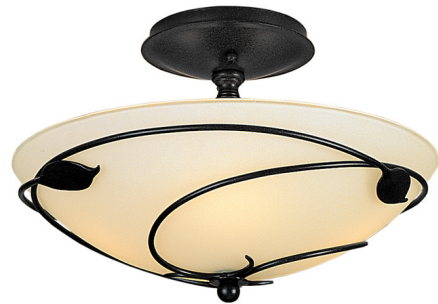
Shown in black / opal

The Forged Leaves Semi Flush Ceiling Light brings a striking visual to your interior space that is both functional and decorative. Hand forged leaf and stems adorn a glass shade that diffuses warm light across your room. Lifetime Limited Warranty when installed in residential setting. Handcrafted to order by skilled artisans in Vermont, USA.