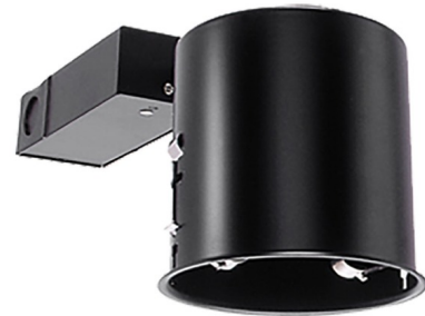
Shown in black

APERTURE SIZE . . . . . 4.000" HOUSING HEIGHT . . . . . 5" HOUSING TYPE . . . . . Remodel NON IC CEILING TYPE . . . . . Drywall with Trim