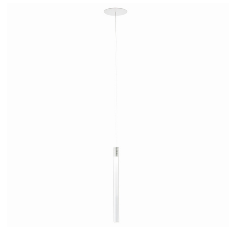
Shown in white / transparent